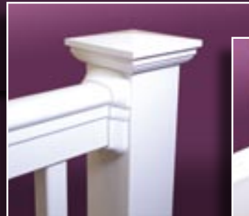
Top Rail Hidden Screw Mount with Trim Cap