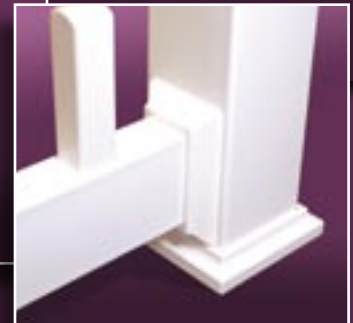
Bottom Rail Hidden Screw Mount