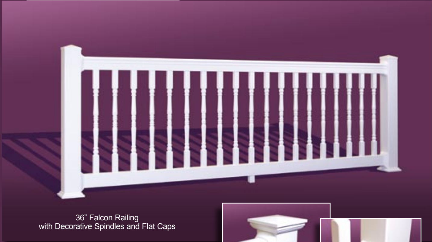
36" Falcon Railing with Decorative Spindles and Flat Caps